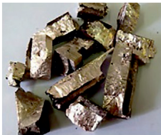
Fig. 1. Master alloy after grinding

As part of the experimental program, a pilot batch of copper–magnesium master alloy was developed and